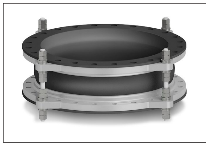
Tie rods with inner and outer limitation type ZSS inside and outside in spherical discs and conical seats. – elongation & compression limitation, lateral movement possible –