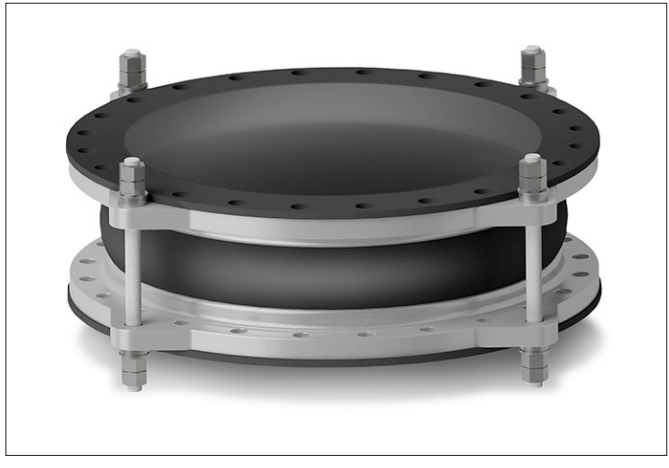
Tie rods with outer limitation type ZS in spherical discs and conical seats. – elongation limitation, lateral movement possible –

The use of tie rods reduces reaction forces at fixed points and hence protects the piping system.