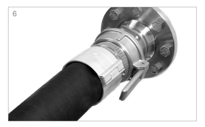
Before starting the transfer of media, close the lever. This puts the coupling lock into function. Further details see overleaf.