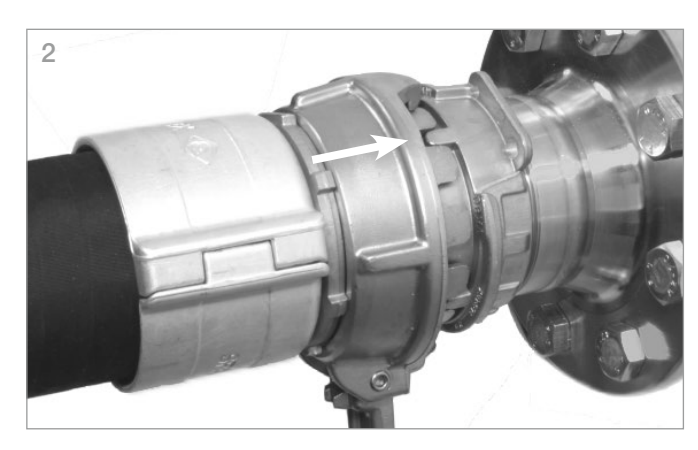
Join both coupling parts - recesses of the female coupling into bars of the male coupling.