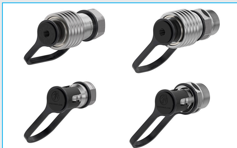
1/2" Quick Release Coupler - Male and Female options available

Fast Flow Filling Systems, Storage Cascade to Trailer/Transporter, Trailer/Transporter connection to Daughter compressor. Suitable for use with Hydrogen, CNG, Helium, Bio-Gas, Nitrogen, Air and other gases on enquiry.